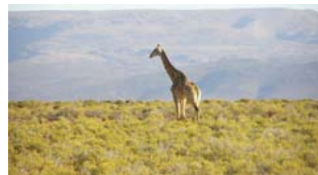
Another inhabitant of the game preserve