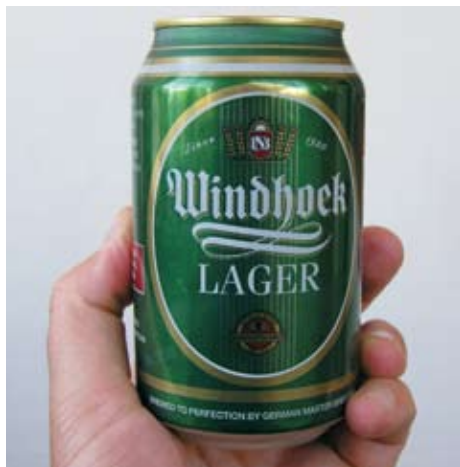
The best local beer was from Namibia

I was limited in where I could run since there is some dangerous