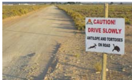
We're not in Texas anymore

Not all of the wildlife was dangerous, however, and that made those morning runs better. On our side of the fence, the long dirt road that I ran daily did have free-roaming small antelope known as springboks, so I entertained myself by trying to get them to chase me. This usually consisted of running down the road until the springboks would get curious