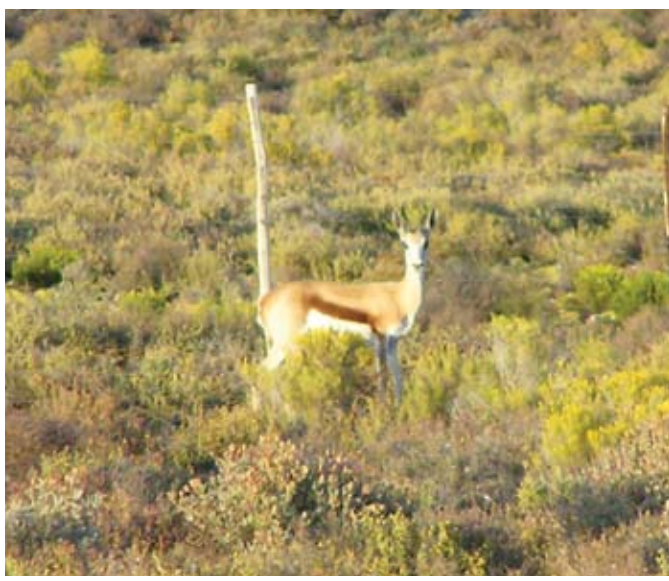
One of my morning running companions